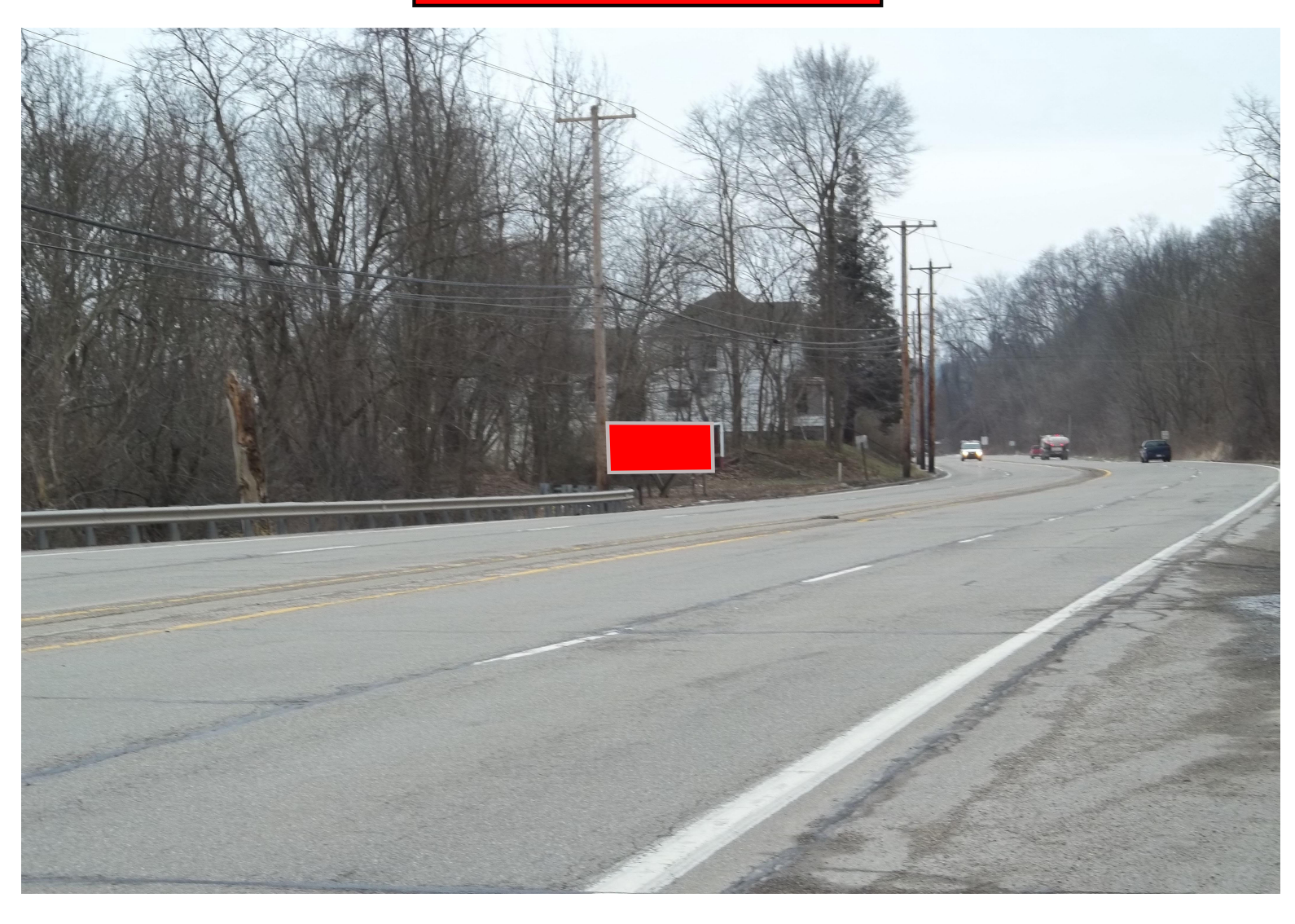
This billboard is located on Rt. 51 going toward South Heights and Moon Twp. from Aliquippa .